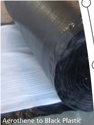
Aerothene to Black Plastic

Protective Packaging made from either Aerothene or BubbleWrap T110, which can be laminated onto a number of materials.