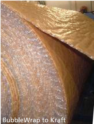
BubbleWrap to Kraft