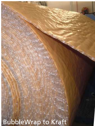
BubbleWrap to Kraft