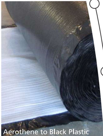
Aerothene to Black Plastic

Protective Packaging made from either Aerothene or BubbleWrap T110, which can be laminated onto a number of materials.